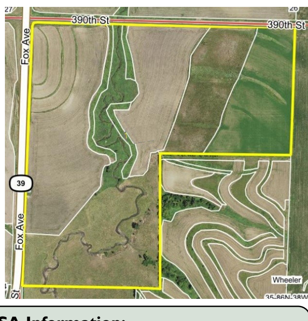
FSA Information: Cropland: 82.44 ac. Corn Base: 64.4 ac. PLC Yield: 145 bu.

Surety/AgriData Avg. CSR2 for cropland acres: 71.8 Surety/AgriData Avg. CSR1 for cropland acres: 63.6 Surety/AgriData Avg. CSR2 for pasture: 67.8 Soils: Kennebec, Marshall, Ackmore, Bolan, Hawick, Kennebec-Ackmore, Monona & Ida Real Estate Taxes: $1,962