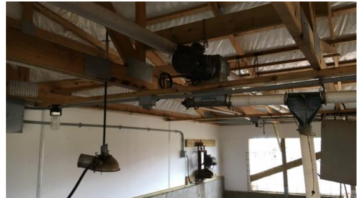
South Buildings Endwall