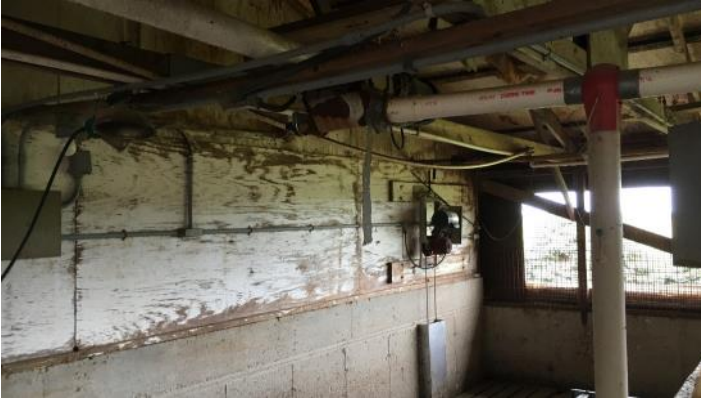
North Building Endwall