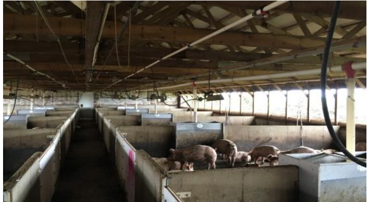
North Building Interior