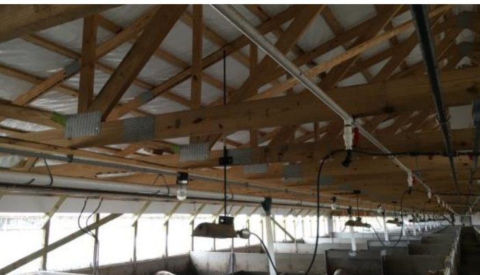
South Buildings Interior