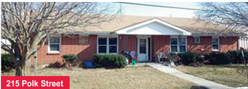
215 Polk Street

Legal: Lot 1 of NE 1/4 Section 36, Twp 83, Range 40, Crawford Co. Iowa This parcel includes possible development land, currently in alfalfa, buildings and an apartment complex currently occupied by tenants, 2-3BR apartments renting for $700 and $800 monthly, 1-2 BR apt rents at $600 monthly, 1-1 BR apt Rents $490.4 units (monthly Gross @ $2,590).