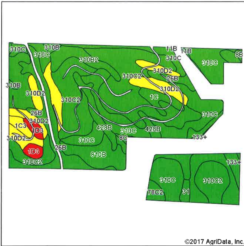
Soils data provided by USDA and NRCS.